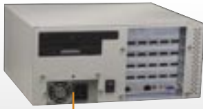
150/200 AT/ATX power supply