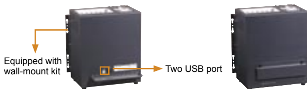
Equipped with wall-mount kit