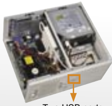
Two USB ports